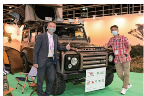
Vehicle displayed in Glamping Pavilion

Of course, ITE in a normal year is much bigger and exhibitors also highly international.