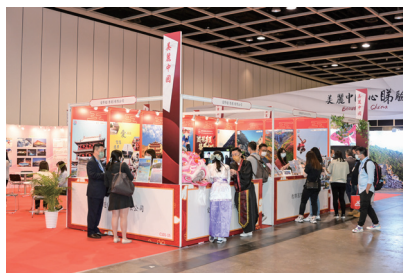
China (Mainland) Pavilion work with Hong Kong Travel Agents