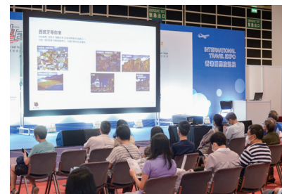
Regular Video Broadcast in Trade Seminar Sessions