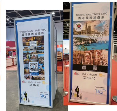
Advertising panels with QR Code