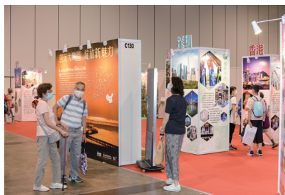
Photo spot in the Greater Bay Area Zone