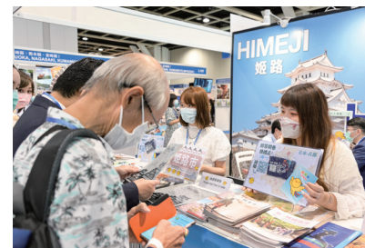
Staff from local office help operating Japanese booths