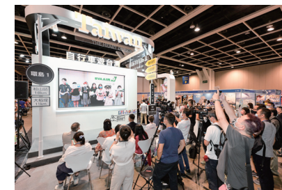
Speakers in Taiwan interact with onsite visitors through zoom meetings in Taiwan Pavilion