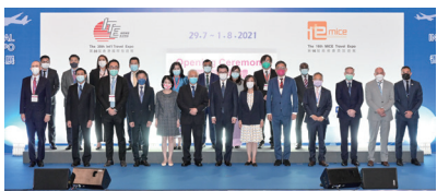
VIP Group Photo: Guests on Stage & over 10 Consul Generals